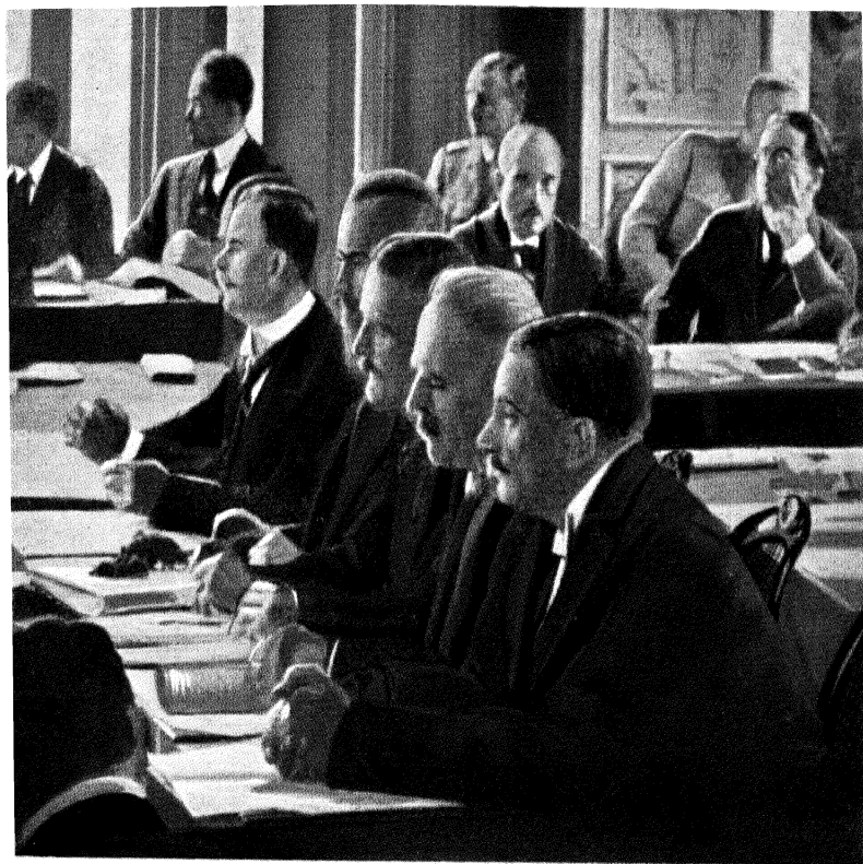
THE GERMAN DELEGATES RECEIVING THE DRAFT TREATY: TRIANON PALACE, VERSAILLES, MAY 7, 1919